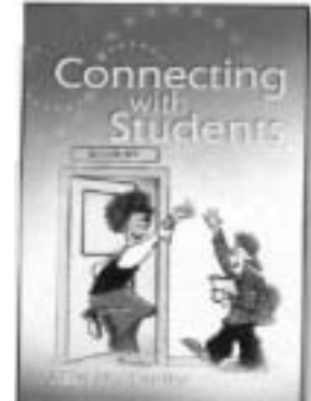
Connecting with Students Allen N. Mendler Book 2001