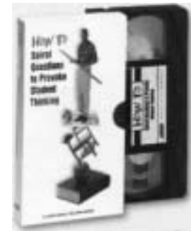
How to Spiral Questions to Provoke Student Thinking Video 2005